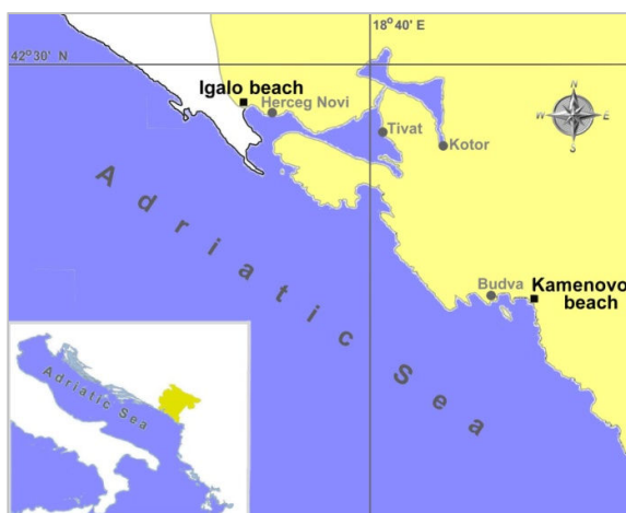
Figure 1. Two monitored beaches: Igalo and Kamenovo

of the beach is small river Sutorina. Table 1 shows GPS coordinates of sampling area on Igalo beach.